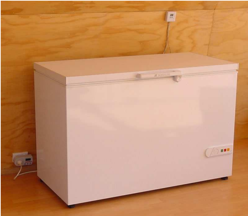
Fig 2. Fully installed chest fridge with thermostat on the wall. Note energy measuring gadget at the bottom left.