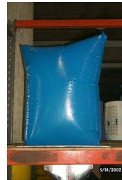
Figure 2. A clear bag before a measurement and a blue bag at the end of a measurement