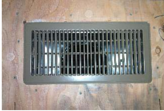
Figure 5. Example supply grille of multi-branch duct system in LBNL laboratory