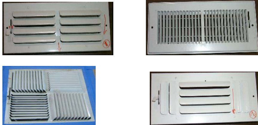
Figure 4. Examples of grilles used for single-branch calibration test apparatus. Clockwise from top left: one-way, two-way, three-way, and four-way throws.